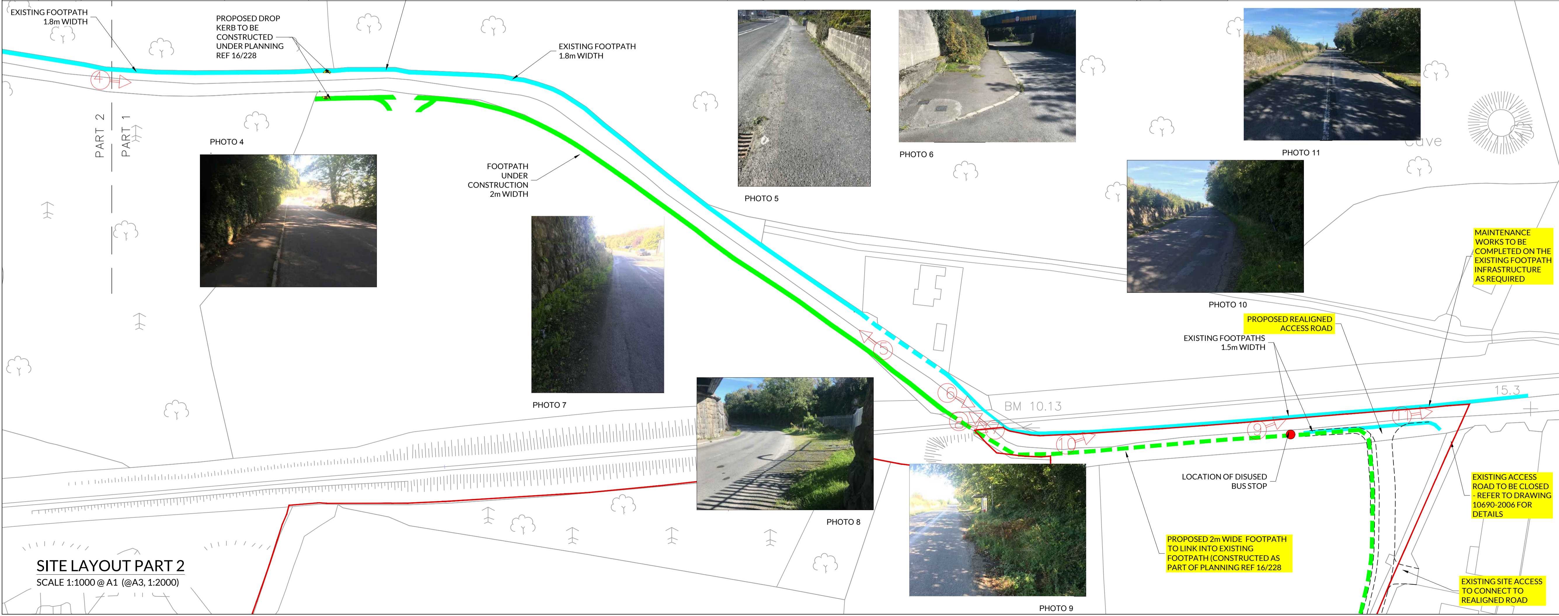
SITE LAYOUT PART 2 SCALE 1:1000 @ A1 (@A3, 1:2000)